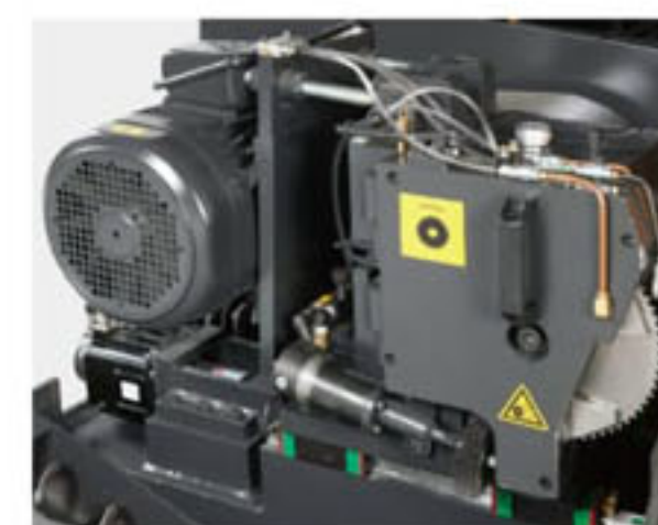
Direct driven saw head for high cutting performance