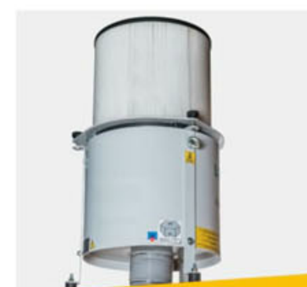
Air Filter (Opt.)