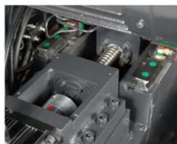
Controlled accurateness through servo motor and ball screw