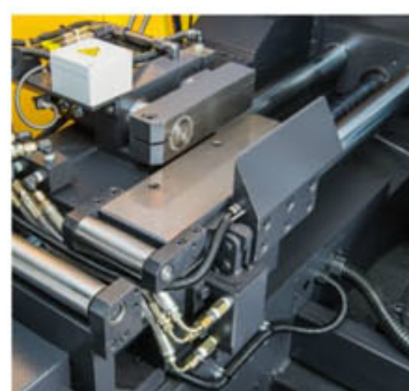
Shuttle floating system