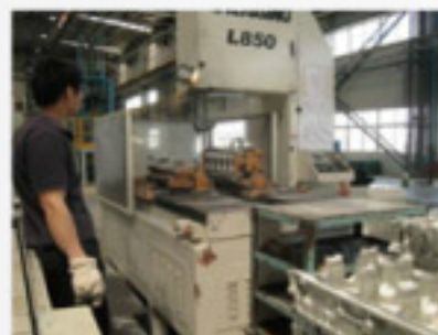
引擎缸體冒口鋸切 Sprue of engine cutting