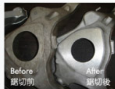
轉向器零件冒口鋸切 Sprue of steering parts cutting