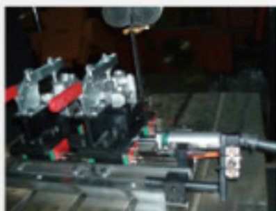
化油器冒口鋸切 Sprue of carburetor cutting